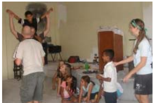
Crowd participation in the story of David and Goliath

I'm thankful I got to see Jesus this night.