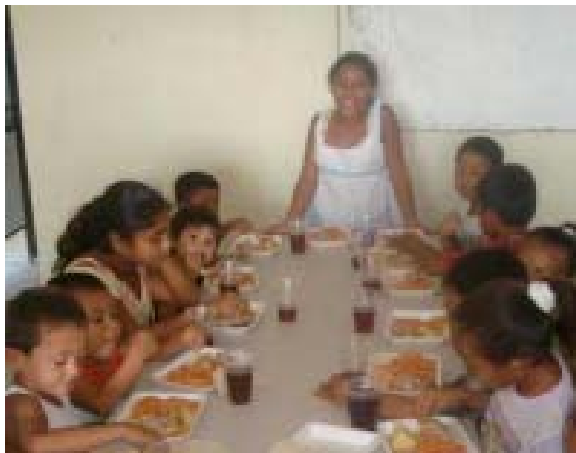
Some of the 100+ Children in Mexico Eating a Healthy Meal During the Feeding Program

Navigating institutional life is seldom easy. The unwritten code of who's in and who's out screams loudly through subtleties. Whether it's through a disapproving glance, not being picked for the team, or being picked on because some kids are mean, orphanage life is tough.